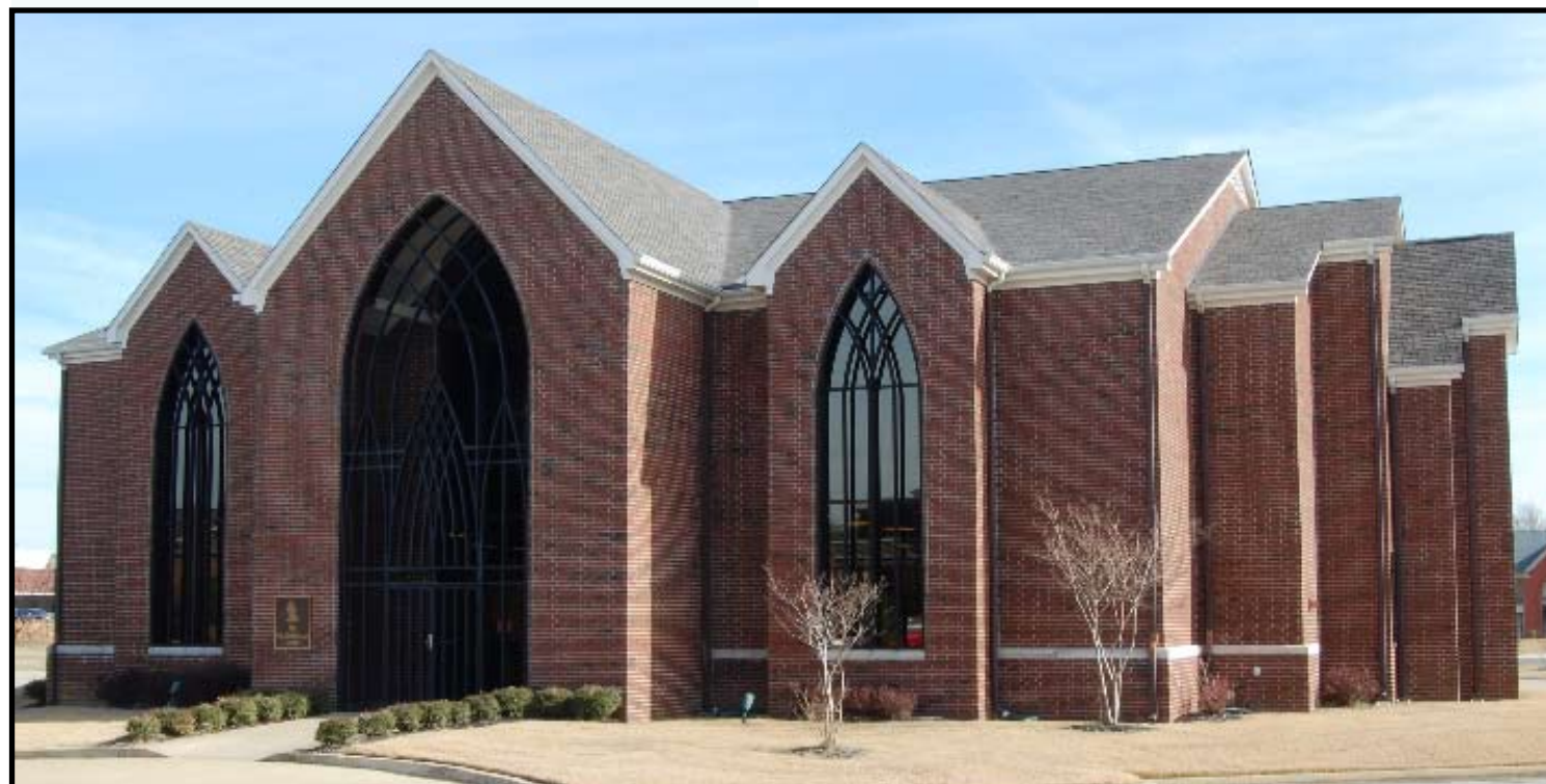
THE N. B. HARDEMAN LIBRARY AT THE MEMPHIS SCHOOL OF PREACHING

Our plans for the Library, as outlined in this issue, will cost $100,000. We know we can count on supporters, who see the special need for a well-equipped Library of excellent resource materials, to help us with these funds. Please mark your contributions "For The Library." Thank you, brethren!