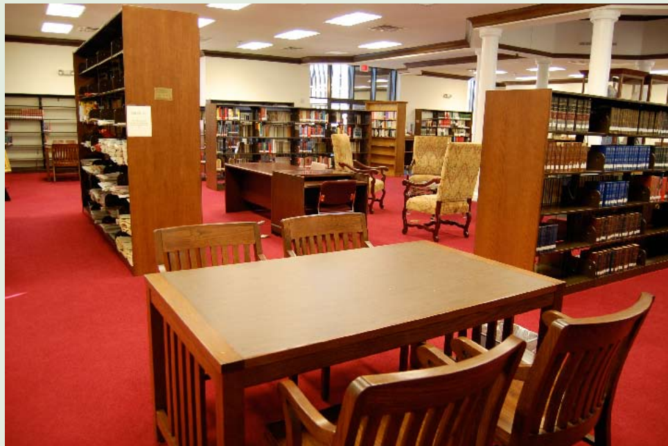
REFERENCE STUDY AREA