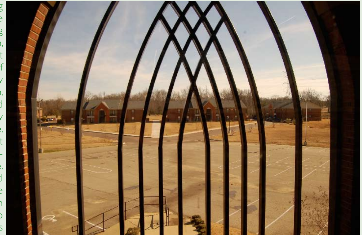
A VIEW, FROM THE LIBRARY, OF THE NEW STUDENT HOUSING

We have a climate-controlled room for valuable archival and special collection materials. These rare items from that area are not available for general use, inasmuch as they require special handling in order to prevent deterioration as much as possible. We encourage friends