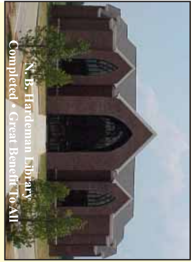
N. B. Hardeman Library Completed • Great Benefit To All