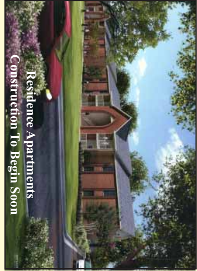
Residence Apartments Construction To Begin Soon